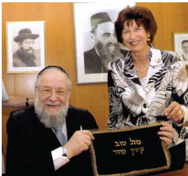
With former Chief Rabbi Meir Lau selling WIZO's chametz before pesach

Of course, my vision and plans are based on full cooperation with our WIZO federations: with our WIZO chaverot worldwide who are the backbone and ground roots of our movement, full partners to all our commitments and achievements, and the wind beneath our WIZO wings. TOGETHER we still have a lot to do. TOGETHER we are a power to contend with. TOGETHER we will reach for the skies and beyond."