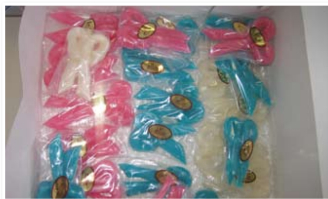
Purim Novies for the children at the Jewish school in Athens

Every year at Purim, WIZO chaverot are rewarded by big smiles, thanks and Hag Sameach greetings when they take novies (candy bows) to the children at the Jewish school. The pink, blue and white candies, made by a confectioner in Larissa, are an eagerly awaited tradition, part of the platicos de Purim exchanged by the children resplendent in their festive costumes.