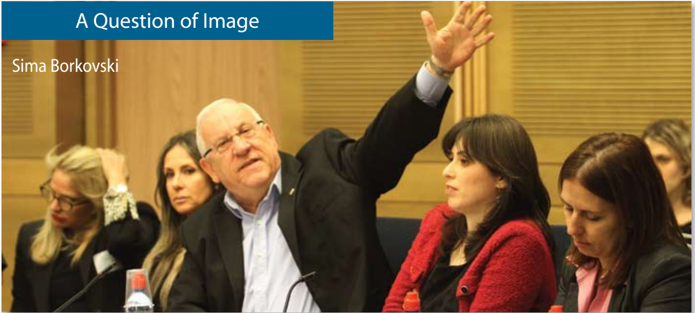
Knesset Speaker MK Ruby Rivlin making his point

The way women are portrayed in the media whether it's a reality show or a sexist campaign can be quite disturbing, to say the least.