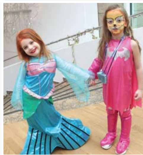
A pretty pair compete in the Luna Park fancy dress competition