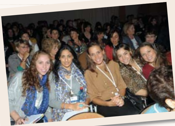
Aviv chaverot enjoying the conference