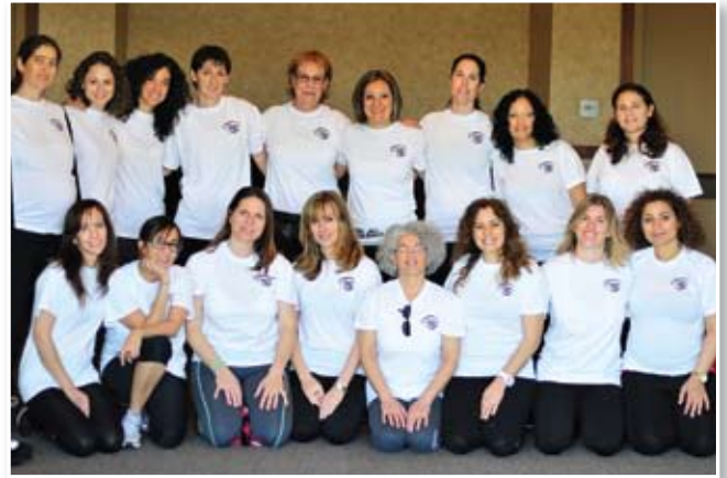
Snapshots from San Francisco Bay's International Women's Day event

WIZO San Francisco Bay Area's successful fundraising event, which was held on International Women's Day, has raised funds for much needed renovations at the Edelstein/Citrin Multipurpose Day Care Centre in Yavne. The event's theme - A Healthy Mind in a Healthy Body - was sponsored by more than thirty businesses in Silicon Valley. Certified sport instructors coached various physical activities including running, walking, yoga, zumba and belly dancing. Professional consultants lectured on nutrition, homeopathy and career coaching. The successful event drew more than 100 participants who enjoyed the varied activities and lunched on wholesome dishes and homemade desserts. It certainly was a day of 'woman power' and female activity to benefit future generations in Israel.