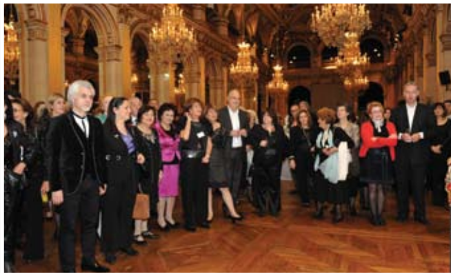
Participants and organizers in the opulent hall of the Hôtel de Ville

WIZO on its important work in the fields of leadership and domestic violence. Guest of honour, director and actor Stephane Freiss drew the winning raffle ticket. Participants also enjoyed a special screening of his very first film. The festive atmosphere was further enhanced by dancing and a delicious meal.