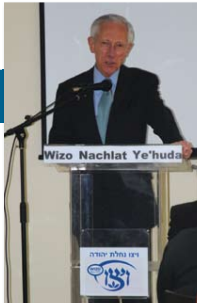
Bank of Israel Governor, Professor Stanley Fisher addressing Nachlat Yehuda pupils

The synagogue, founded in 1701, was in the village which bears its name – located between Padua and Venice, and was last used in 1917. It was dismantled and brought to Israel in 1951. A curator gave the group a fascinating talk about the synagogue and the adjacent museum.