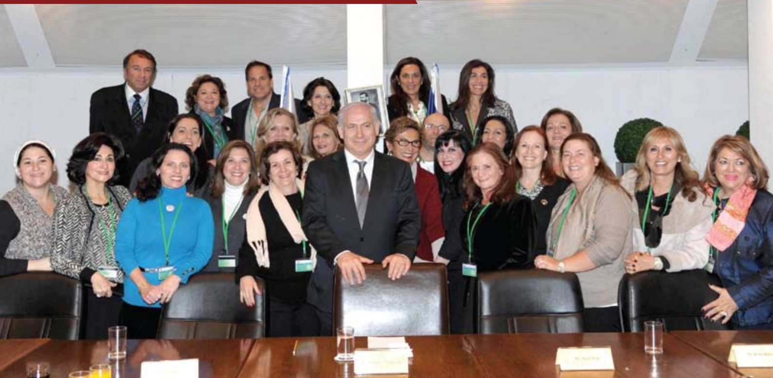
Prime Minister Netanyahu Meets with USA EGM Delegation

During WIZO USA's pre-EGM mission, the delegation had the privilege and honour of meeting privately with Prime Minister Netanyahu at the Ministry of Defence. The Prime Minister dedicated over an hour of his valuable time to discuss the situation with Iran, Syria and Gaza, the issue of illegal immigration from Africa, and other topics brought up by the WIZO USA chaverot.