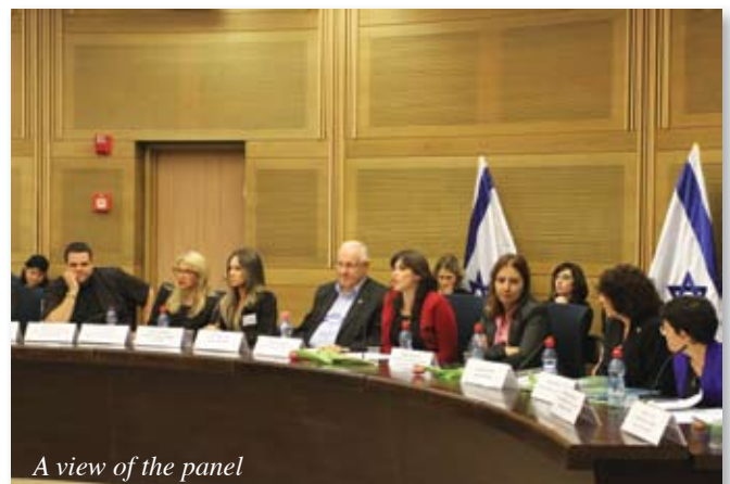
A view of the panel