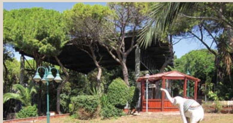
The gardens with iconic elephant and covered sports court in the background