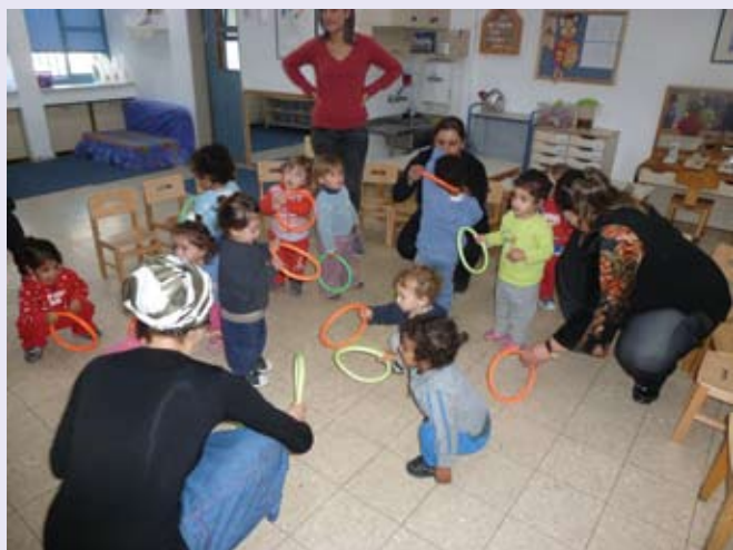
Children happily playing at the Shapira Day Care Centre

The music studio and all of the other projects that the Mary Bendet Foundation magnanimously sponsors truly support the foundation's mission to "encourage and inspire children