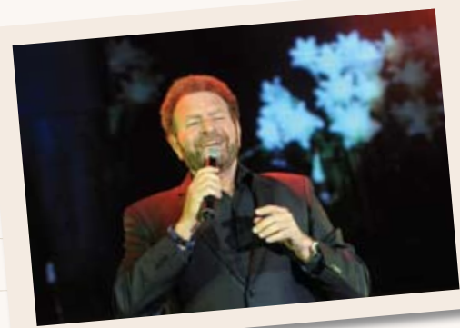
Dudu Fisher sings his heart out

The final session was approval of recommendations and resolutions emanating from the previous afternoon's workshops, which set out WIZO's work plan for the next four years.