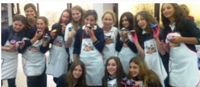
Bat Mitzvah girls attend cooking class in Bogota