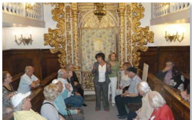
FOW supporters learning the history of the Conegliano Veneto Synagogue