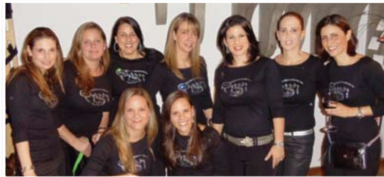
WIZO Jai Sara Rose members

The Children's Museum in Paseo Colon was transformed into an enchanting concert hall when WIZO Jai Sara Rose hosted Costa Rican international diva Debi Nova accompanied by the Costa Rica Philharmonic Orchestra. Singer Debi took time off from her busy schedule to create a beautiful fundraising event in aid of the children of the Gilo (Jerusalem) day care centre sponsored by WIZO Costa Rica. Attendees were given the opportunity to donate to WIZO's Sponsor A Child project. After the concert, cocktails were served and guests were told about the wide range of WIZO's activities in Israel. The evening was a great success thanks to the hard work of the dedicated chaverot of WIZO Jai Sara Rose, Debi Nova and the orchestra director who also assisted with the event.