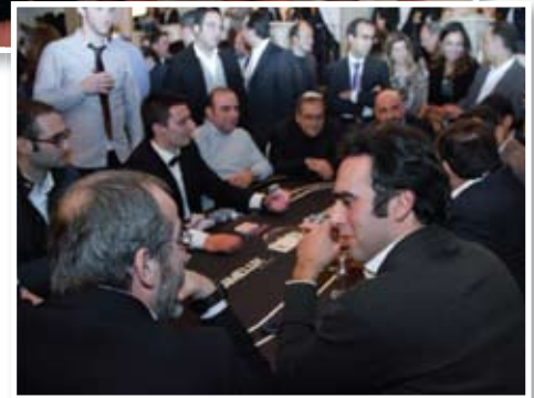
Guests placing their bets for WIZO