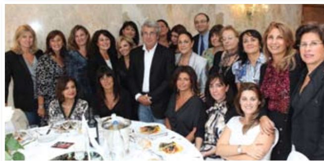
Simcha Aviv group members with (front centre) celebrated comedian Michel Boujenah

extraordinary grace and skill on the dance floor but the French federation is rather hoping for an Israeli winner in the future.