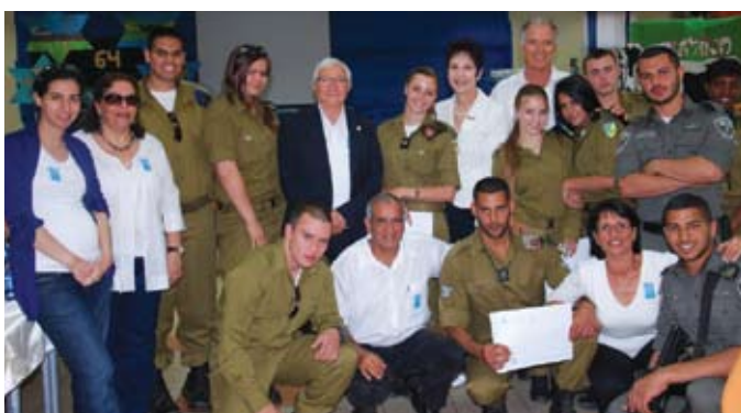
At WIZO Nachlat Yehuda Youth Village on Memorial Day, awarding matriculation certificates to graduates

personal motto: To lead with wisdom and care , not only with chochmat hadaat - 'the wisdom of the mind,' but also with chochmat halev - 'the wisdom of the heart,' sharing, stimulating, delegating authority and caring for the wellbeing of our members and our employees.