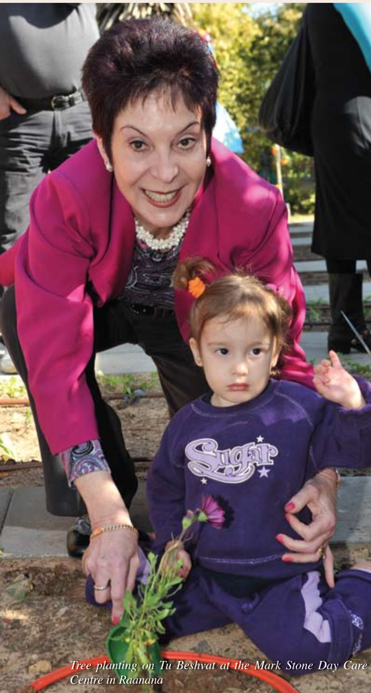
Tree planting on Tu Beshvat at the Mark Stone Day Care Centre in Raanana

making, saves time and energy and enhances motivation, satisfaction and well-being. Our devoted employees are an inseparable part of the organization, whether it is an efficient secretary, or a house mother who takes the place of a biological mother providing each of the pupils under her wing with care, love and support.