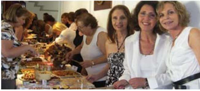
The Jerusalem Group invites the audience to sample 'The Sweet Things in Life'