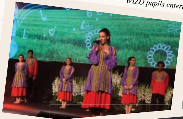
WIZO pupils entertain

Monday evening was dress-up time for the official opening in the presence of Israel's president Shimon Peres, and Deputy Prime Minister Silvan Shalom. The audience was enchanted by an artistic and musical entertainment programme, featuring many talented youngsters from WIZO schools and youth centres.