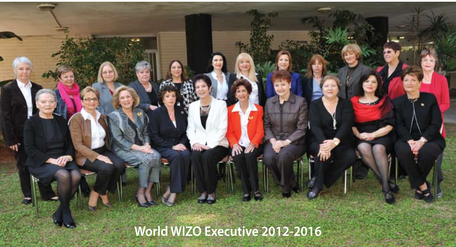
World WIZO Executive 2012-2016