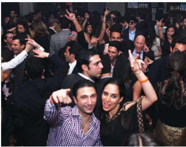
New York's Young leadership party to benefit the children of Israel