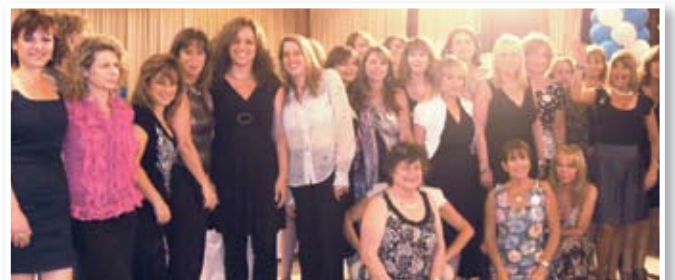
Chaverot from new groups formed in 2011 enjoy A Night of Friendship