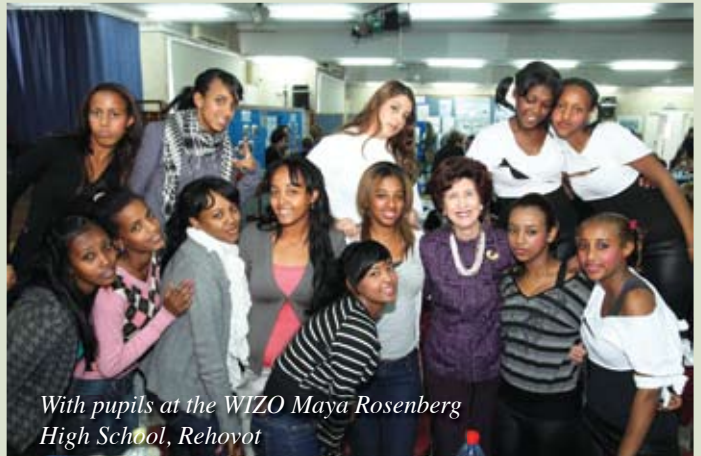
With pupils at the WIZO Maya Rosenberg High School, Rehovot