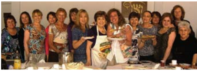
Jewish Cooking Class