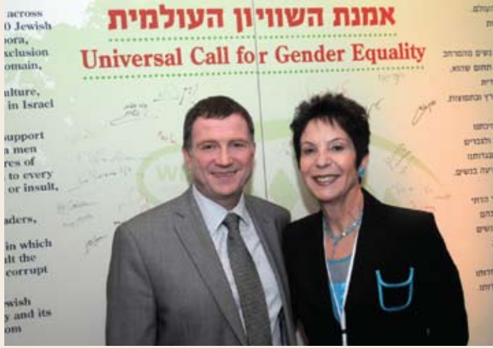
With MK and Minister of Public Affairs and the Diaspora Yuli Edelstein at the EGM in January