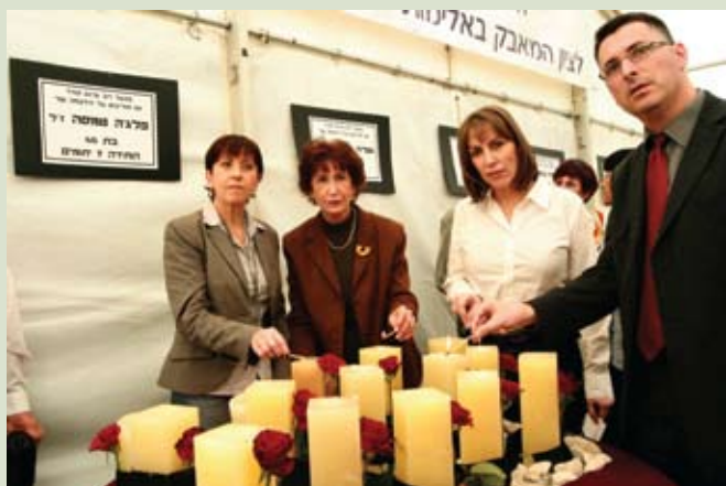
Lighting candles in WIZO Israel memorial tent on the International Day for the Elimination of Violence Against Women. (l to r) MK Zahava Gal-On, Tova Ben-Dov, Minister of Culture and Sport Limor Livnat, Minister of Education Gideon Sa'ar

and led a special WIZO emergency team to aid evacuees from the north escape the incessant bombardment of Katyusha rockets. WIZO opened its schools and youth villages throughout the country to receive thousands of residents who sought refuge out of harm's way. Our glorious federations supported us admirably. Their solidarity with Israel resulted in a magnificent $3.5million to WIZO so that we could alleviate the suffering of our northern neighbours. I am reminded of that heartbreaking time whenever I look at some of the many letters of thanks written by grateful citizens, one of which contained the phrase: WIZO bombarded us with Katyushas of love. "