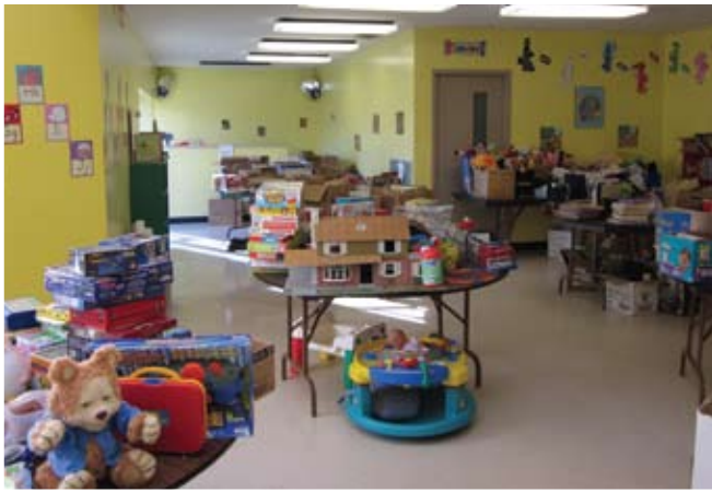
Set out and ready for business at the London Bazaar

CHW (Canadian Hadassah WIZO) London's 51 st annual bazaar held at the Jewish Community Centre had something for everyone. Among the bargains were Israeli-made Naot shoes donated by the Solemates Naot store in Toronto, a huge variety of books, toys, clothes, house wares, sporting goods, jewellery, linens, pictures and other treasures. All the hard work by the illustrious bazaar team paid off as an impressive $14,000 was raised.