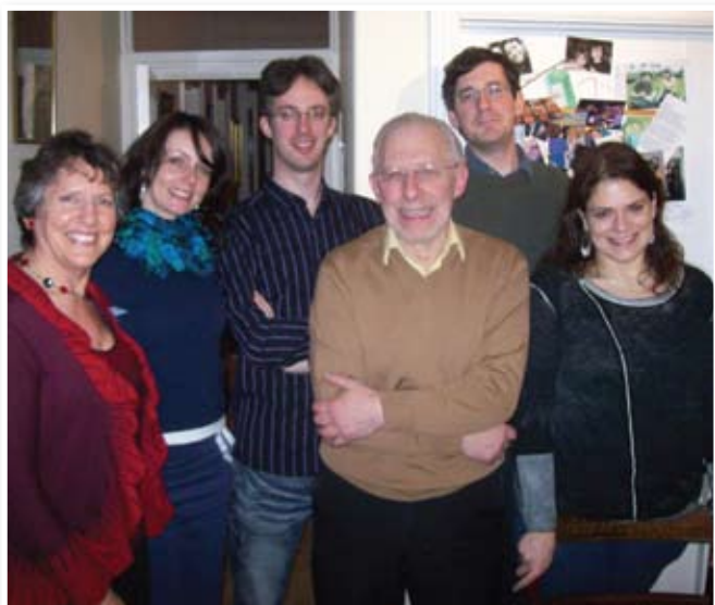
The winning team in Oxford

One hundred and thirty teams enjoyed a challenging and fun evening across England, Scotland, Wales and the USA for the annual online WIZOuk Quiz@home 2012. Teams were tested on several subjects including music, current affairs, history and general knowledge. Over £30,000 was raised for vocational projects in Israel.