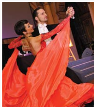
Dancers move with style and grace