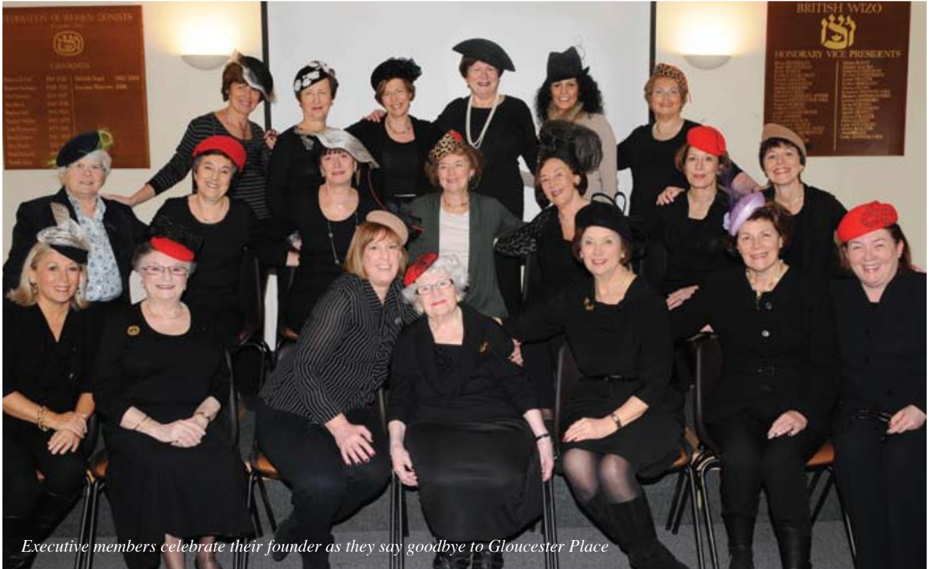
Executive members celebrate their founder as they say goodbye to Gloucester Place